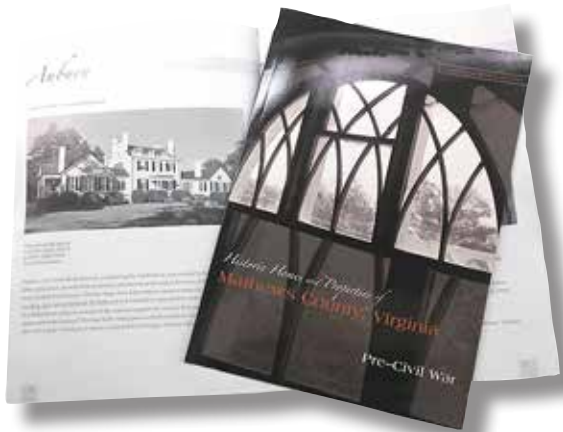
MCF provided funding support for the publication of the fifth in a series on homes and properties in Mathews.

This grant supported the VersAbility's Puller Center to support employment, job training, and day support services for Mathews County residents with disabilities served at the Puller Center. It provided program support and supervision to individuals returning to their respective day programs, program activities, life skills training, and accompanying supplies. The Community Strides program provided assistance for mandatory counseling programs aimed at reducing recidivism rates among residents of Mathews County.