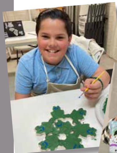
The Open Arts After School Program provided 5.5 hours of art instruction every week at the Bay School.

This grant provided funds to present two chamber music performances at the Mathews Memorial Library.